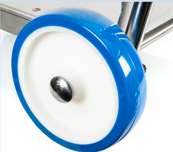
Non marking wheels

Manufactured in Germany with maintenance free, chemical resistant synthetic side bearings.