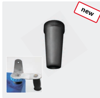
ST-83 adapter for 5 - 30 liter canisters. Incl. 0.5 m clear PVC hose for suction of chemicals, DN 4