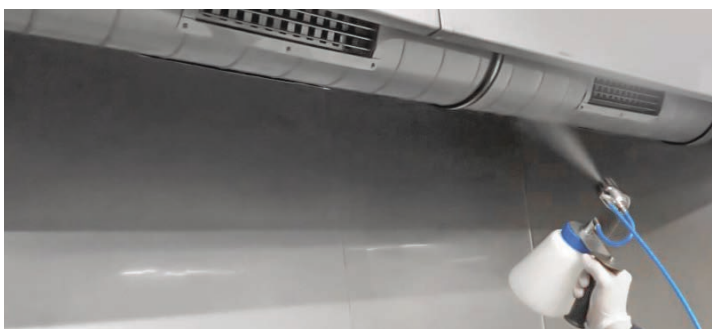
Ventilation systems: For the targeted disinfection of the air inlet you will find the nozzle for the larger throw range in the scope of delivery.