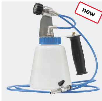
Disinfection cold fog air device ST-83. For compressed air connection 3 bar, 180-220 l / min. Stainless steel / plastic