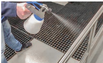
Partial cleaning: Also used as a handheld device, contaminated surfaces can be easily reached with the cold mist.