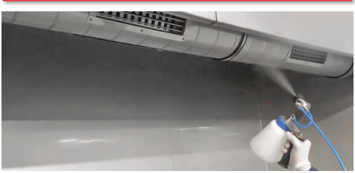
Ventilation systems: For the targeted disinfection of the air inlet you will find the nozzle for the larger throw range in the scope of delivery.

ST-83 is supplied with a 0.7 mm dosing insert.