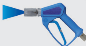
Conical spray jet

How the ST-2320 works with adjustable nozzle