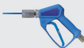
Long-range pencil jet