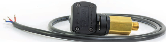
Connection cable: Length of 950 mm