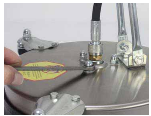
Lift the housing off the swivel fixture. Check the nozzles on the old swivel as they may be reusable.