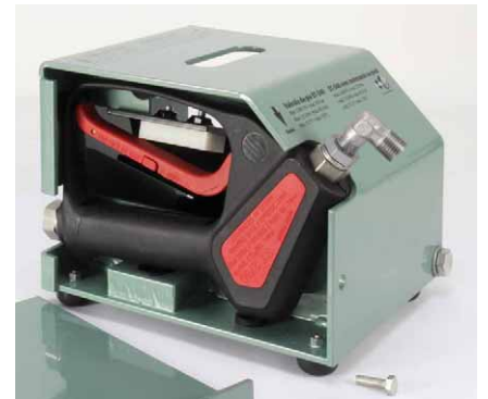
possible versions: integrated ST-2605 with 350 bar or ST-2750 with 500 bar